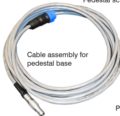
Cable assembly for pedestal base