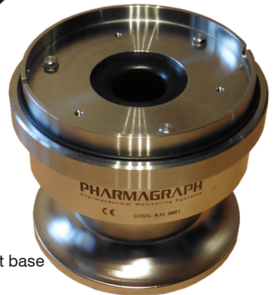
Pedestal bayonet base