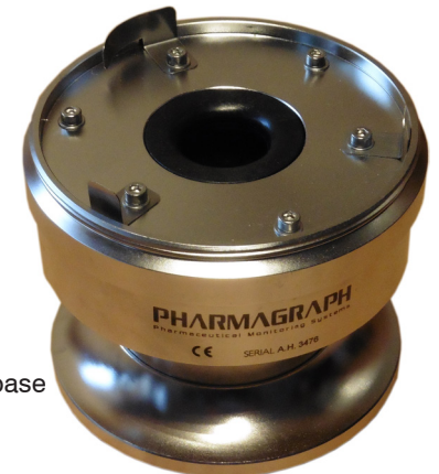
Pedestal screw base