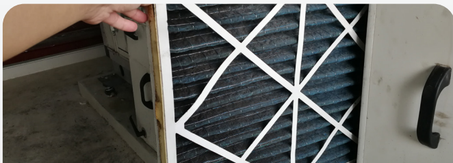
COMPRESSED AIR FILTER