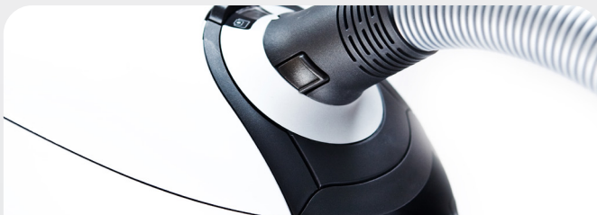
VACUUM CLEANER FILTER