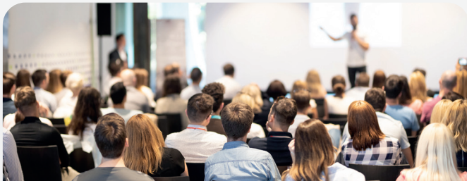
CONFERENCES AND LECTURES