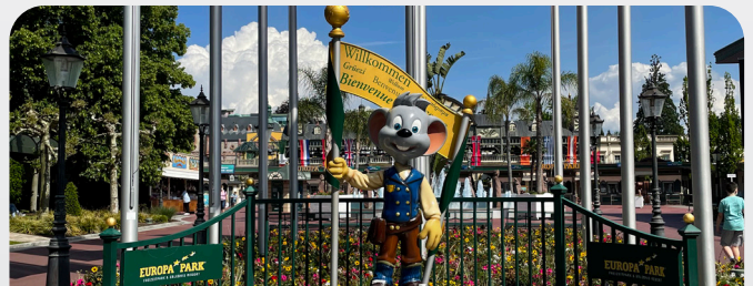
(INDOOR) LEISURE ACTIVITIES