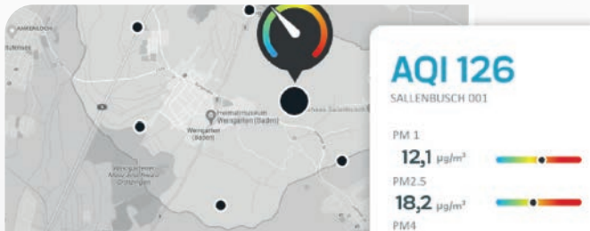
REGULATORY ENVIRONMENTAL MONITORING