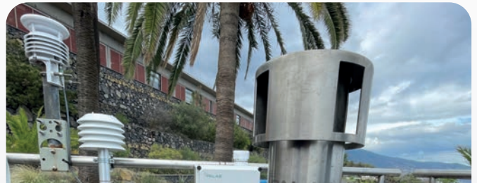
IMMISSION MEASUREMENT CAMPAIGNS