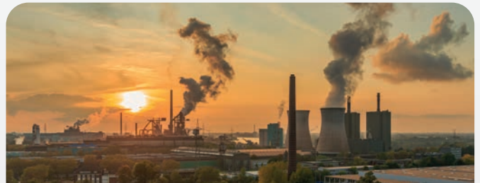
EMISSION SOURCE ALLOCATION