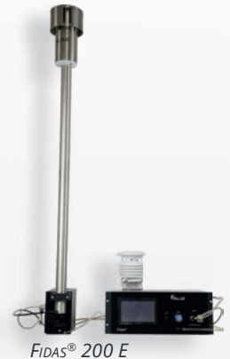
FIDAS ® 200 E

All functions, calculations and controls are managed via an integrated, secured PC (Windows 10 IoT), which offers all the important communication interfaces and protocols. Client-specific adaptations are possible to ensure a future-proof investment.