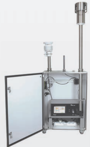
FIDAS ® 200 S