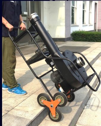
Stair walker dolly