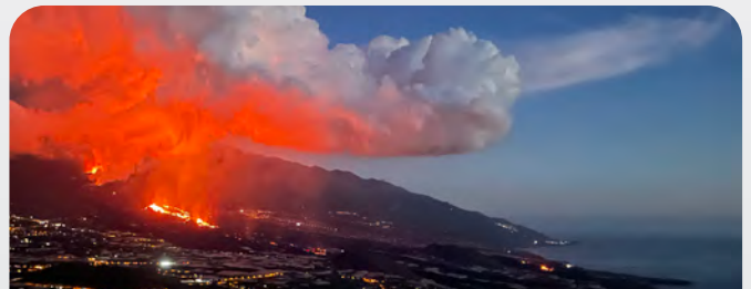
NATURAL RISK AREAS