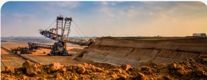
OPEN PIT MINING & LANDFILLS