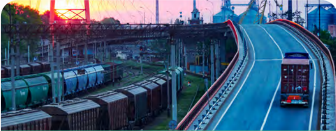
NETWORK WITH ROADS, RAILS & PORTS